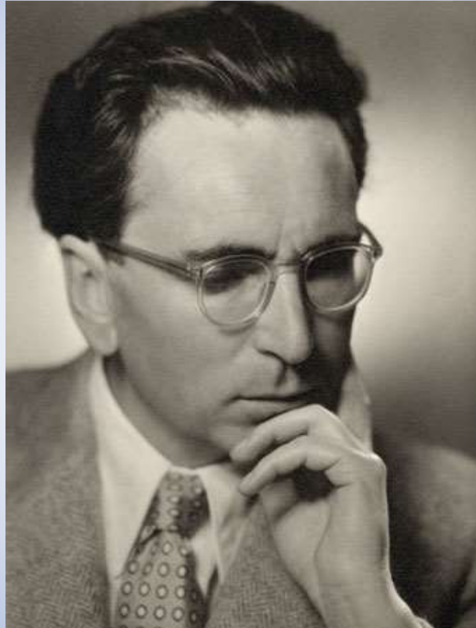
Viktor Frankl 1905-1997