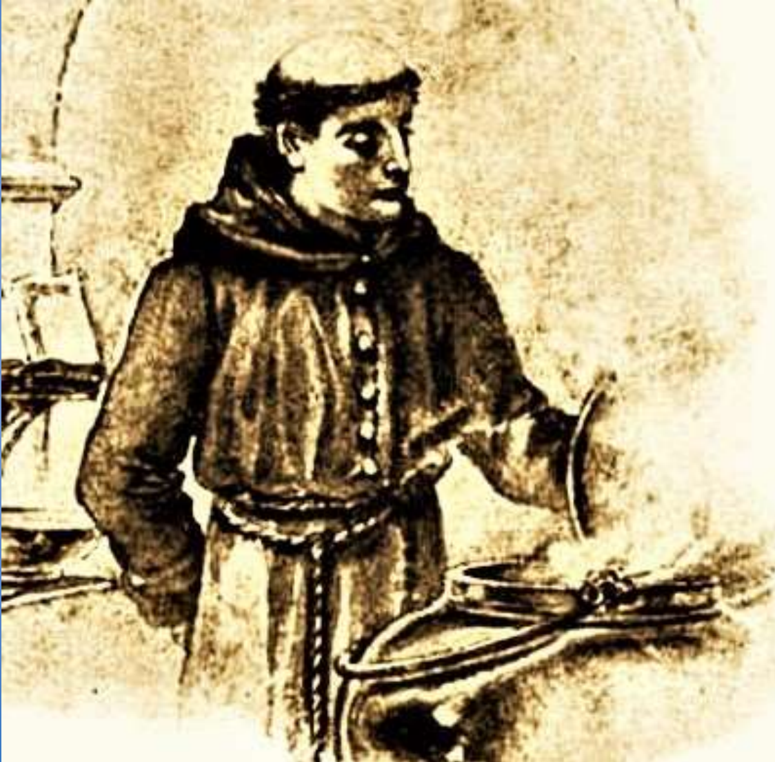
Brother Lawrence 1611-1691