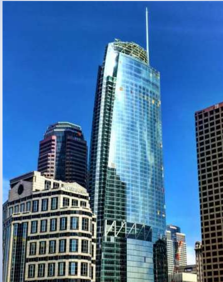
Wilshire Grand Center