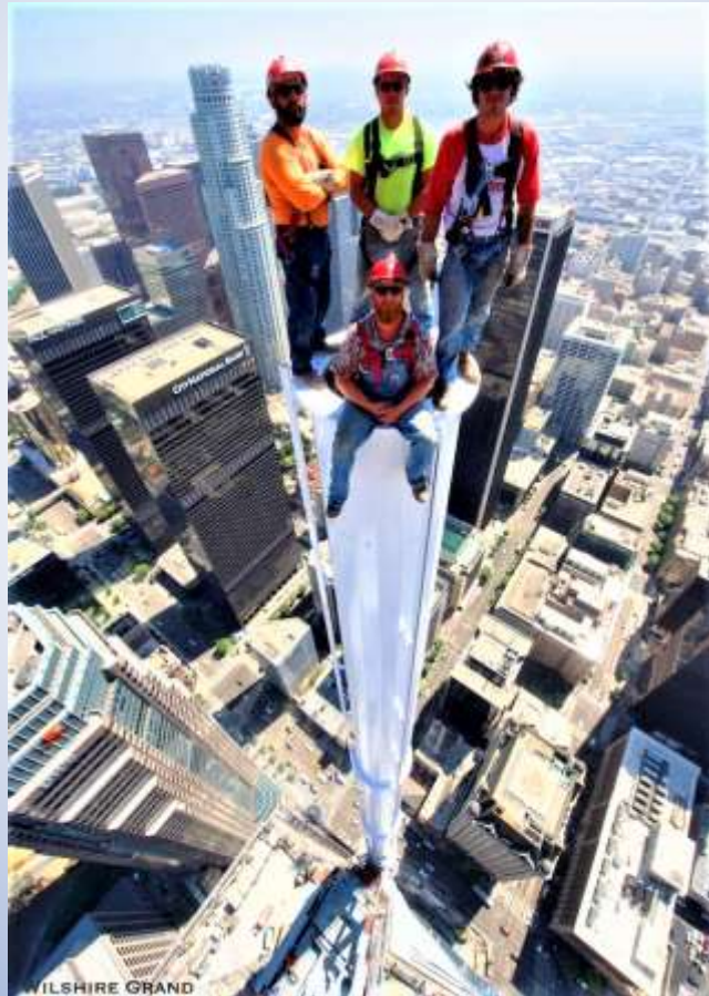
Wilshire Grand Center