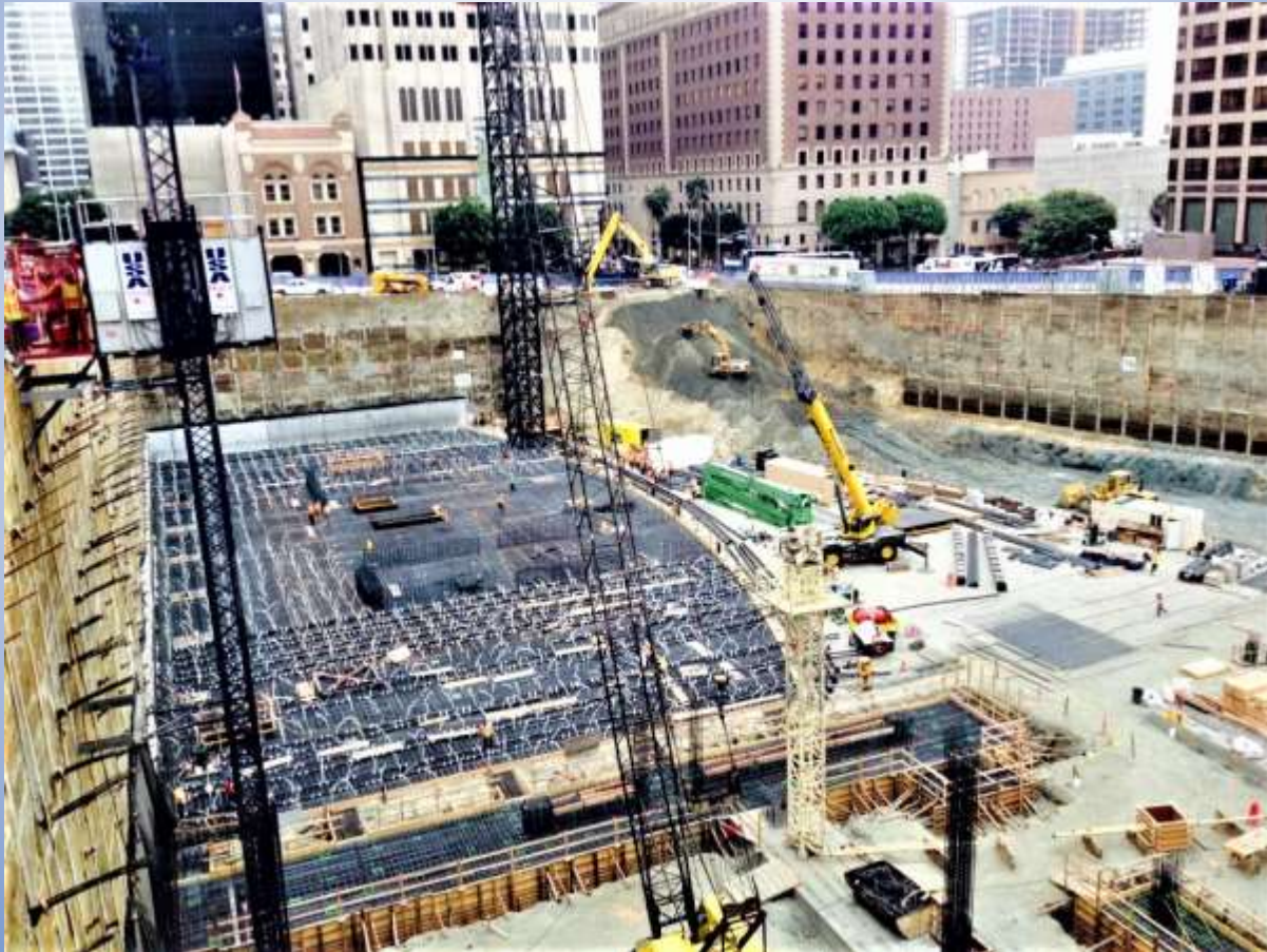
Wilshire Grand Center