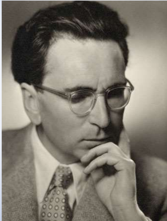
Viktor Frankl 1905-1997