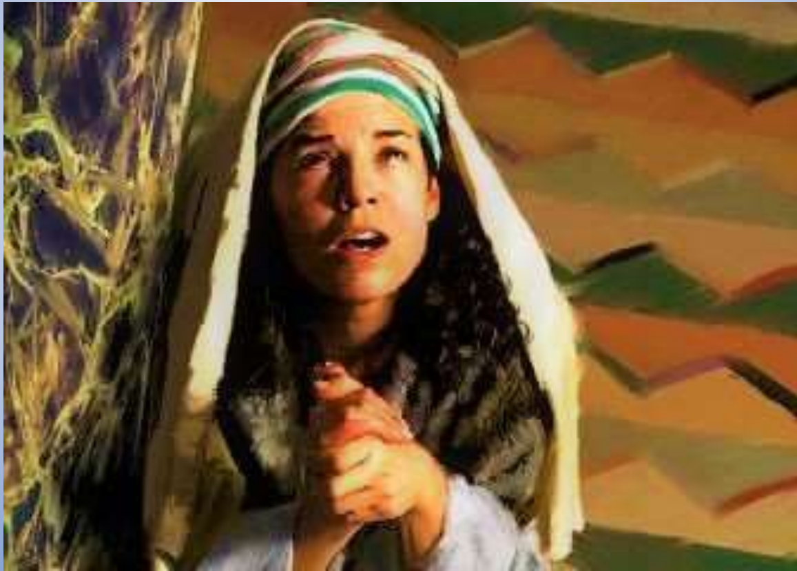
Hannah (1 Samuel)